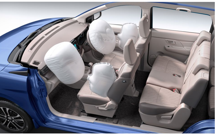
DUAL FRONT AIRBAGS AND SEAT SIDE AIRBAGS FOR ENHANCED SAFETY

The Rumion comes loaded with safety features to keep you safe all the time, allowing you to enjoy the good vibes of peace of mind.