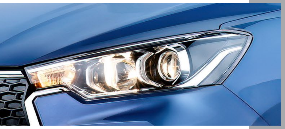
AUTO HEADLAMP Featuring follow me home function