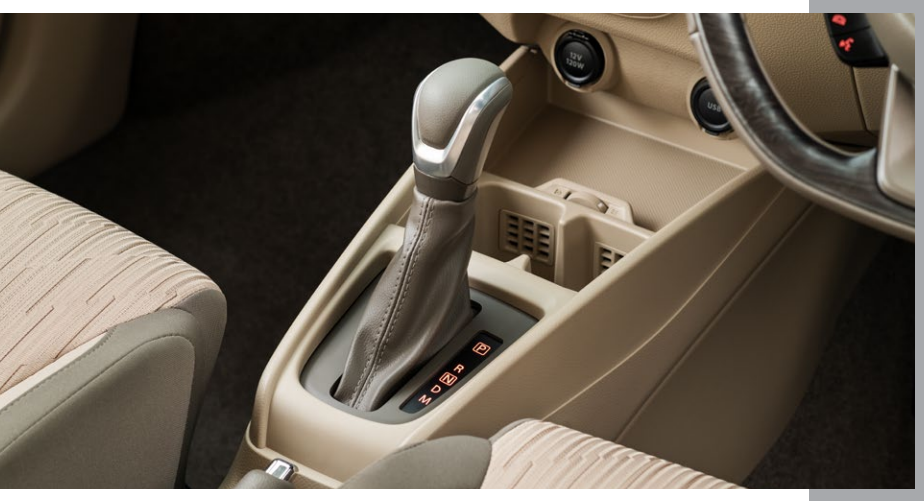
6-SPEED AUTOMATIC TRANSMISSION