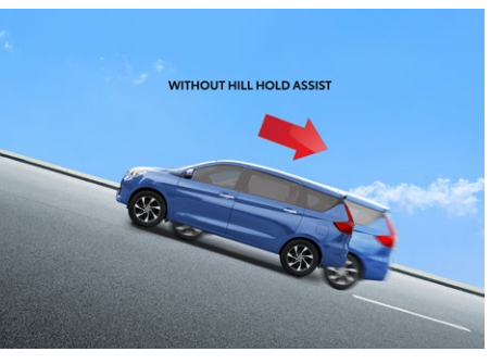
HILL HOLD ASSIST