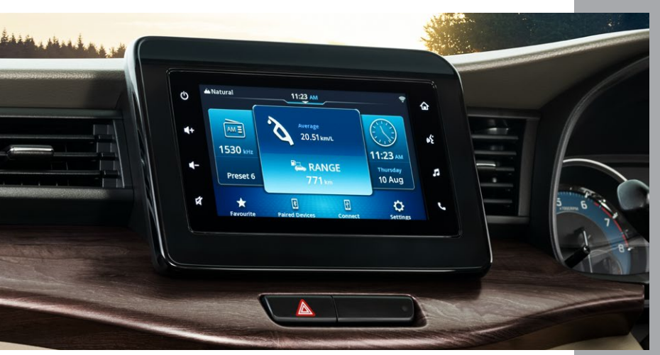
17.78 cm SMARTPLAYCAST AUDIO Display audio with wireless Android Auto and Apple CarPlay

SMARTPHONE CONNECTIVITY* Remote immobilisation | Tow alert | Remote start/stop