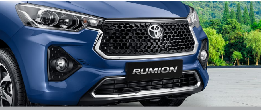
PREMIUM GRILLE WITH CHROME FINISH ON THE FRONT BUMPER

Everything about the Rumion is designed to exude stylish vibes. Take for instance its premium front grille with chrome finish bumper. So no matter where you go, you are always upbeat and full of cheer.