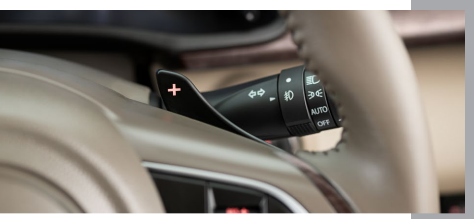
PADDLE SHIFTERS FOR BETTER PERFORMANCE

*Disclaimer: Fuel Efficiency as Certified by Test Agency under Rule 115 of CMVR, 1989 under standard Test Conditions, Actual Mileage on Road may vary.