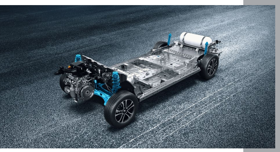
POWERFUL 1.5L (0.001462 m<sup>3</sup>) K SERIES ENGINE E-CNG technology for CNG grade | Fuel-efficiency of 26.11 km/kg<sup>*</sup> for CNG grade